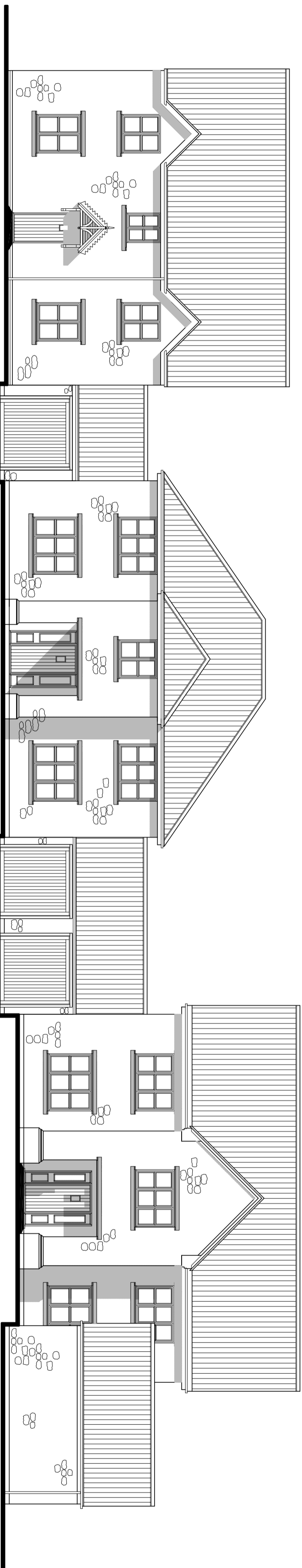
PLOT 3 - HAMILTON